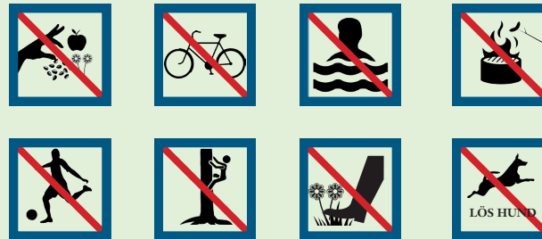
Illustration map with area symbols: Veronica Lendel

The garden originated as a donation made by the two brothers Bergius at the end of the 18th century. Since 1885 the garden is located here in Frescati and is today part of the Royal National City Park. Large parts of the garden is protected, classified as state-owned historic building (statligt byggnadsminne).