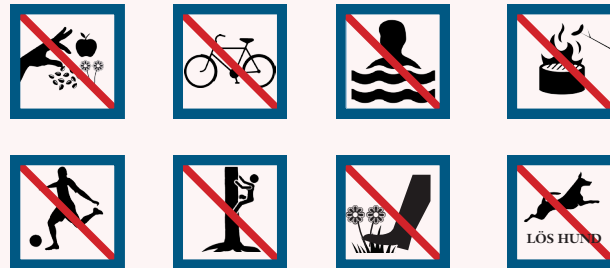
Illustration map with area symbols: Veronica Lendel

The garden originated as a donation made by two brothers of the Bergius family at the end of the 18th century. Since 1885 the garden has been located here in Frescati and is today part of the Royal National City Park. Large parts of the garden are protected, classified as state-owned historic buildings.